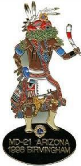
1998 P V