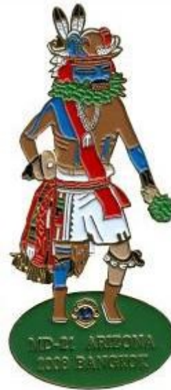
2008 P V

2008 Regular issue has minor color variations. Notice regular pin has two white stripes above blue sock. Variation has a brown stripe and a blue stripe.