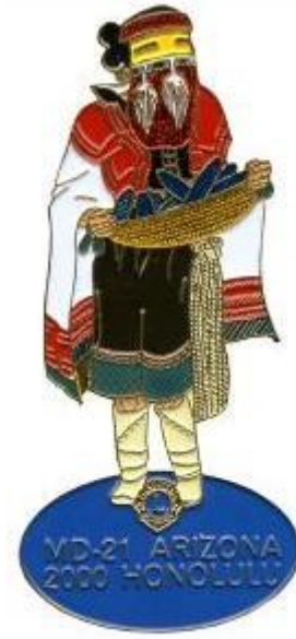
2000 P V