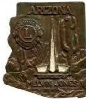
1968 P Bolo