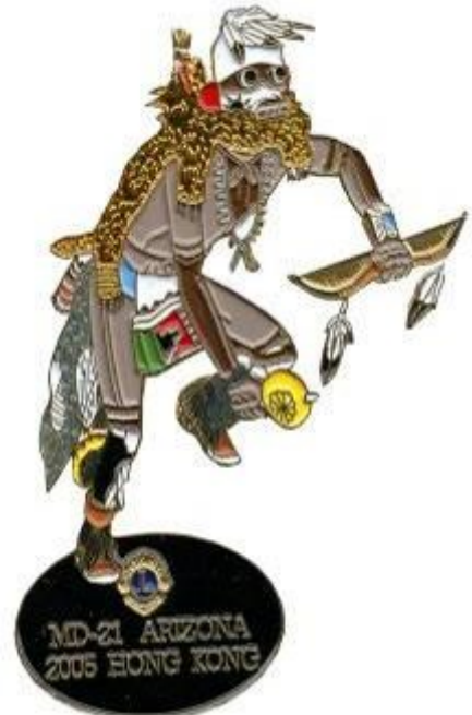
2005 P V