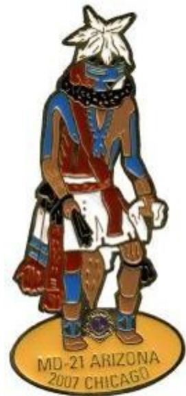
2007 P V