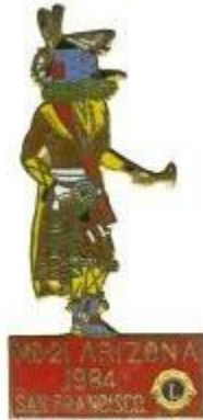
1984 V Large Emblem