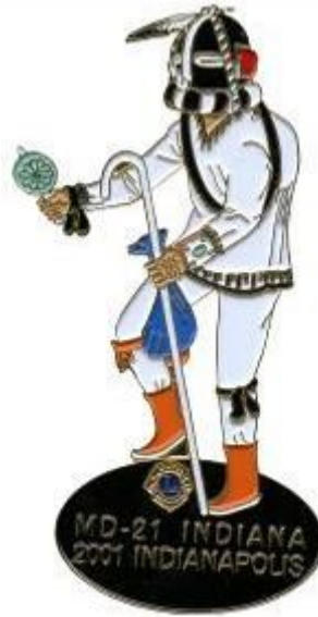
2001 P V

From 1977 forward MD 21 put the name of their state, Arizona, on their pins along with the City in which the International Convention was being held for that year. In 2001 the Convention was in Indianapolis, Indiana. They mistakenly put Indiana instead of Arizona on the first issue of the pins. They had to go back and correct it. Thus they had two sets of pins that year.. As they had done in several previous years they issued some pins with different colored bases.