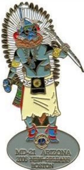
2006 P V

The red base pins beginning in 2003 through 2006 are numbered 29 through 32