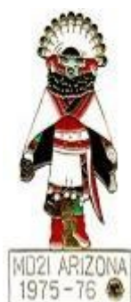
1976 V Die Strike

This issue was initially made in semi cloisonné with both a waffle back and a plain back. It was also made in die strike with a number 2 on the reverse. Like all of the others in this series it was reproduced.