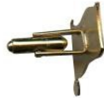
1970 Cuff Links