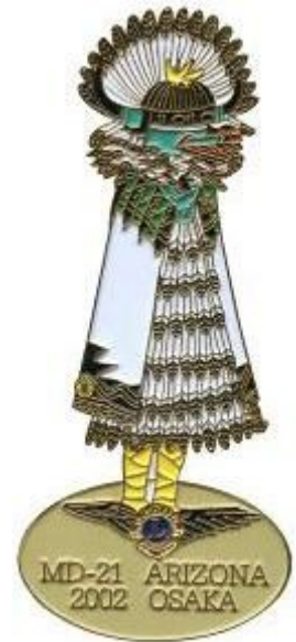
2002 P V

The black base pins beginning in 1999 through 2002 are numbered 25 through 28