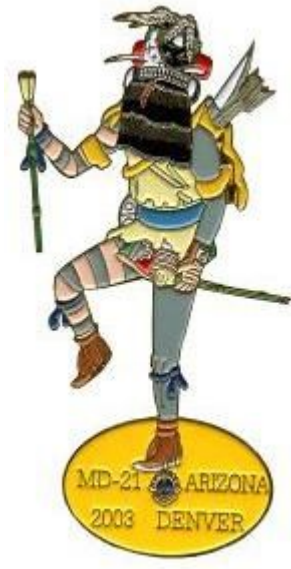
2003 P V