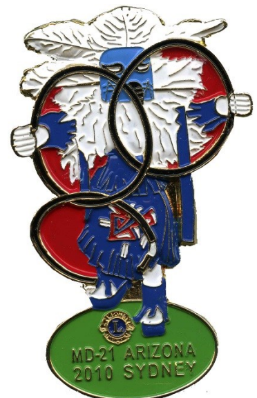
2010 P V

The 2010 Variation has a dull gold paint between the body and the blue ribbon on the right of the pin.