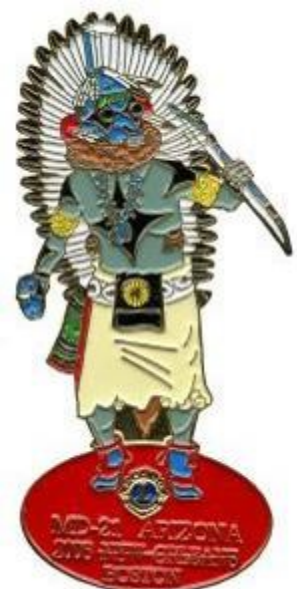
2006 P V

The red base pins beginning in 2003 through 2006 are numbered 29 through 32